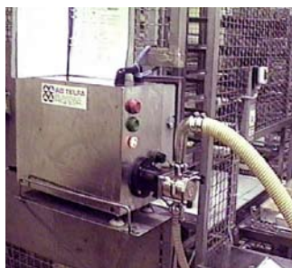
Telfafill Compact has a space-saving design and is easy to put in place.