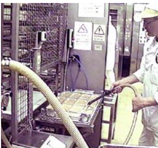
The machine starts automatically after the pre-set time.

The machine has been used on daily basis for several years and has considerably increased the filling efficiency.