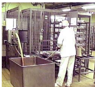
Telfafill Compact sucks liverpaste batter from the storage vat.