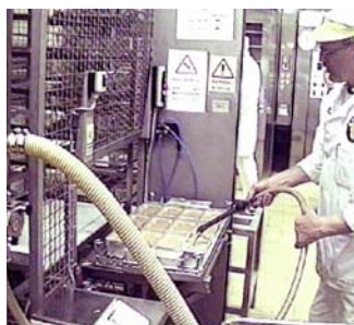
The machine starts automatically after the pre-set time.

The machine has been used on daily basis for several years and has considerably increased the filling efficiency.