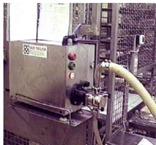
Telfafill Compact has a space-saving design and is easy to put in place.