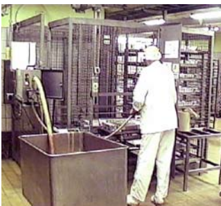
Telfafill Compact sucks liverpaste batter from the storage vat.