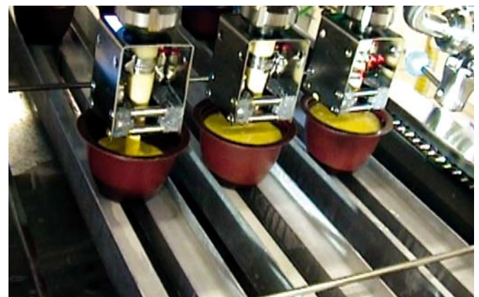
Cola dessert filling with Fillflex Compact Sequence.

Fillflex Compact Sequence equipped with hose valves for filling of three containers in a sequence.